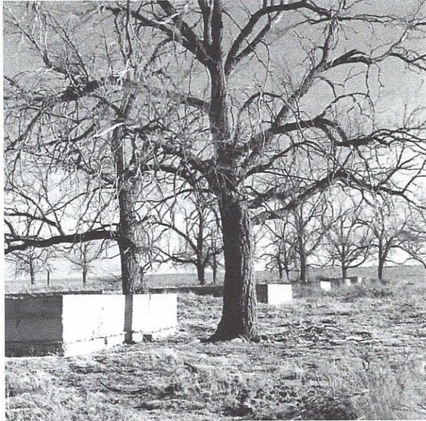
Amache: Barrack foundation with a Chinese elm planted by the incarcerated

A recording of the presentation is on the GLA website.