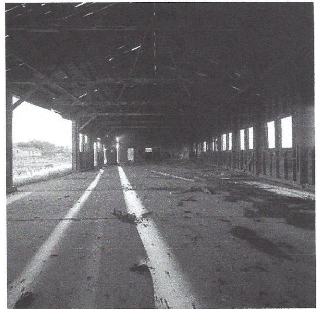
Tule Lake: The interior of the firehouse